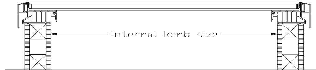
FRONT ELEVATION (DEPTH)

If you wish to place an order please sign and email/fax back.